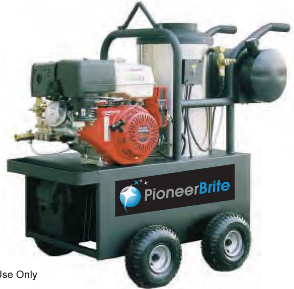
For Outdoor Use Only