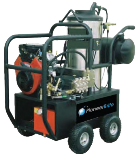
Shown with optional front roll cage

*May be used with mobile water tanks - Requires additional Plumbing and Inlet Filter - Minimum 3/4"