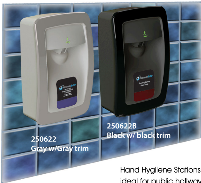
250622 Gray w/Gray trim