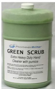
105670 flat gallon

This ideal all-purpose hand soap contains aloe and vitamin E. It has a ruby color and fresh tropical scent, and fits both our manual and No Touch wall dispensers.