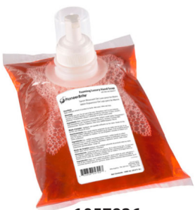
1057926 wall refill 6 / 1000 mL