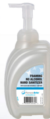
105782 Desk Size Hand Sanitizer 8 / 950 mL

Trust PioneerBrite for complete hand hygiene care