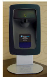
250627 Counter Stand

Our No Touch has same great features as our slimmer Manual dispenser plus these important extras: