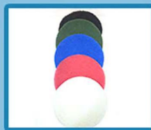
FLOOR MAINTENANCE PADS