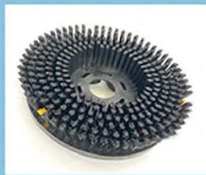
Ceramic Tile/Unsealed Floors