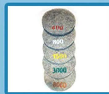
STONE POLISHING PADS