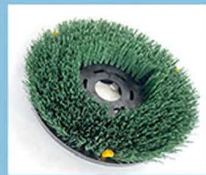
Deep Aggressive Cleaning