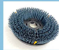
Deep Restorative Cleaning